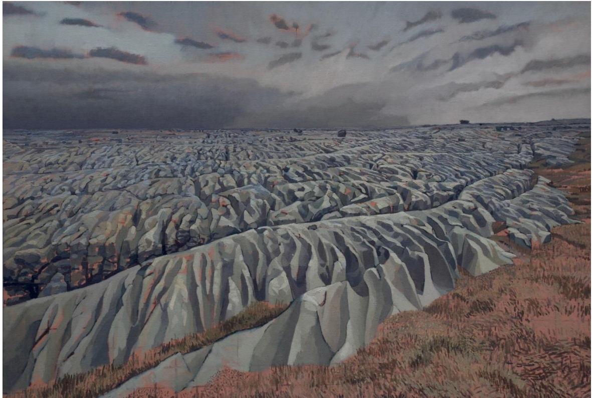
Figure 2. Robert Newell Great Asby Scar II. Oil on canvas, 106.7x152.5cm.