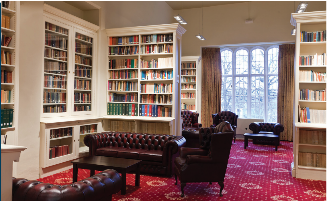
The Founders' Library at UWTSO, Lampeter; one of the rooms used for DProf residential workshops